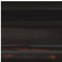
Ferré black lacquered